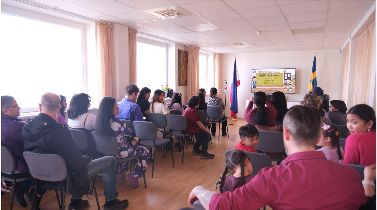
Opening of the Balik-Eskwela Silid Aralan sa Embahada Termino III