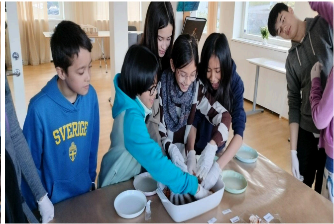
Slid Aralan students enjoyed the lumpiang shanghai making activities.