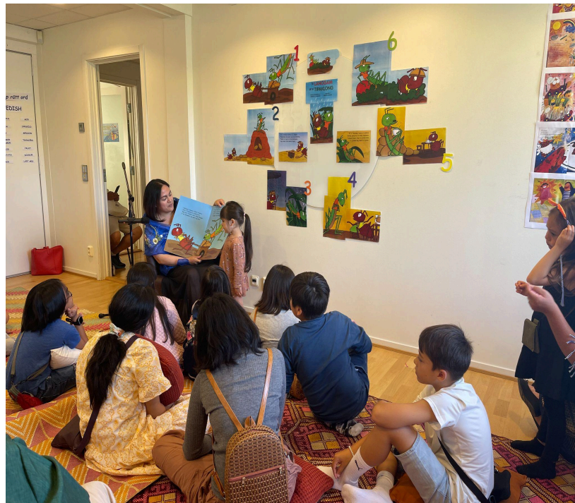
(Above Photos) Storytellers as they read the books