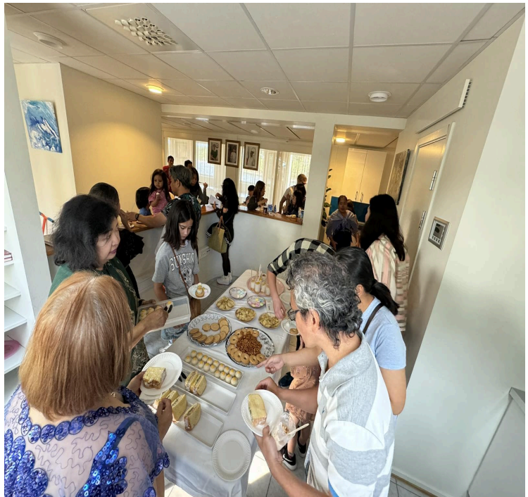
Guests enjoying the Haluhalo Espesyal and Mais Con Yelo