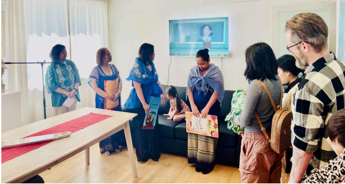
Guests listened to the invocation