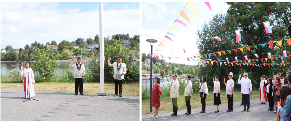
Reciting the pledge to the Philippine flag