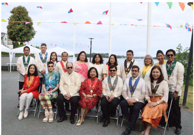
Embassy personnel with family members

Following the flag raising ceremony, guests were invited to witness the graduation ceremony of the students of the Silid Aralan sa Embahada - Termino II, a project carried out in collaboration with the Philippine Education Society (PES).