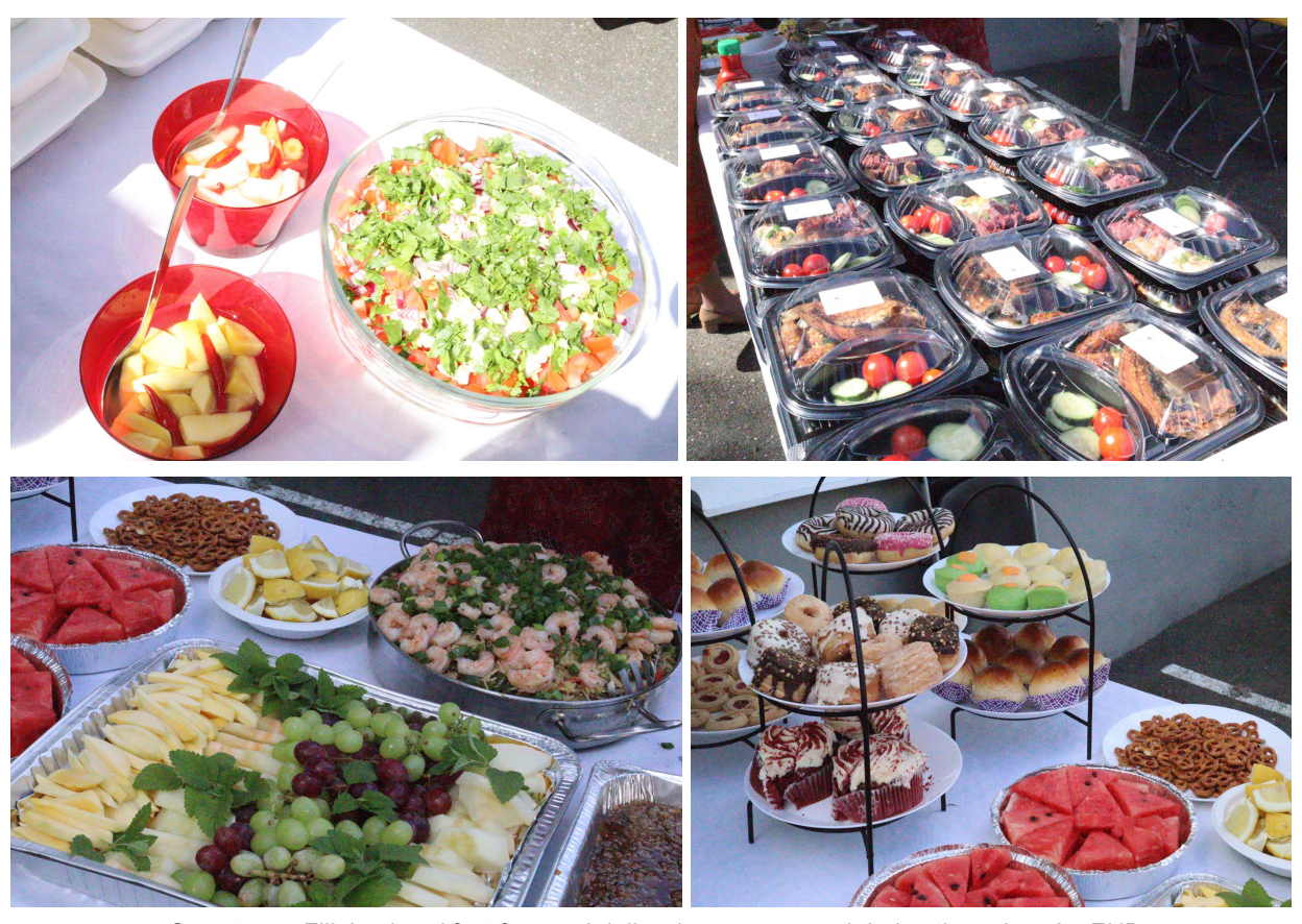
Sumptuous Filipino breakfast fare and delicacies were served during the salo salo. END.