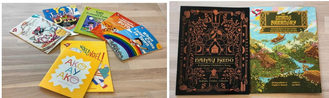
Filipiniana Library Children's books collections

Currently, the Library carries a collection of children's books in Filipino and English and will continue to build its collections to include books which will cultivate a better understanding of Philippine history and heritage.