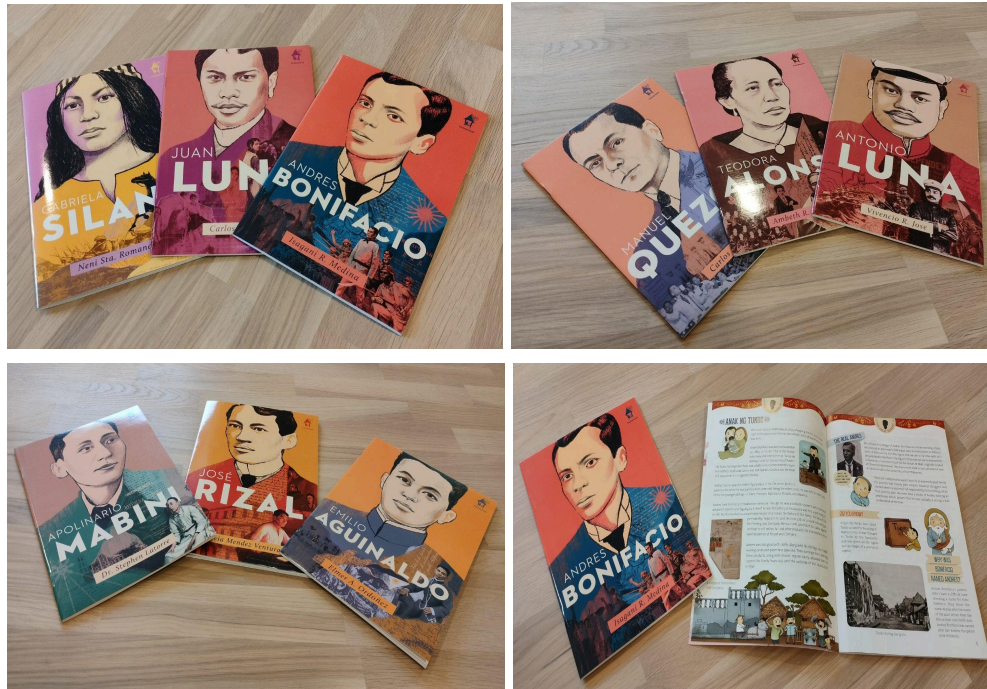
A collection of books about Filipino heroes and Philippine History are available in the Filipiniana Library.

The Embassy has been particularly keen to attract young Filipino, Filipino - Swedish kids by way of bringing in picture books, story books, toys and games that cater to these younger set. Books also dealing with Philippine culture, history, heritage, values, myths and legends are also featured in the Library's growing collection.