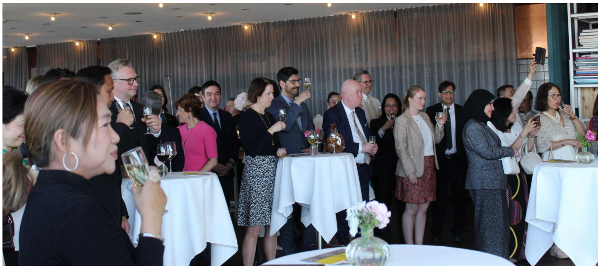
Guests raising their glasses for a toast