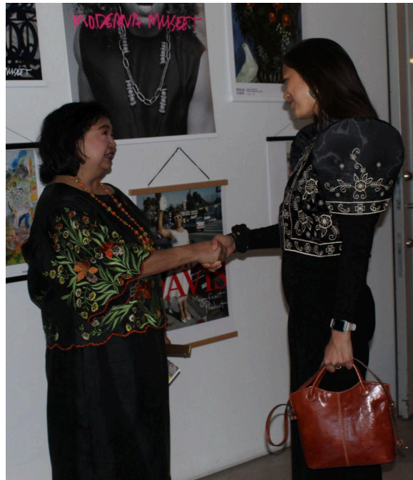
Amb Isleta welcomes guests from the diplomatic corps, Swedish government, private sector/community.