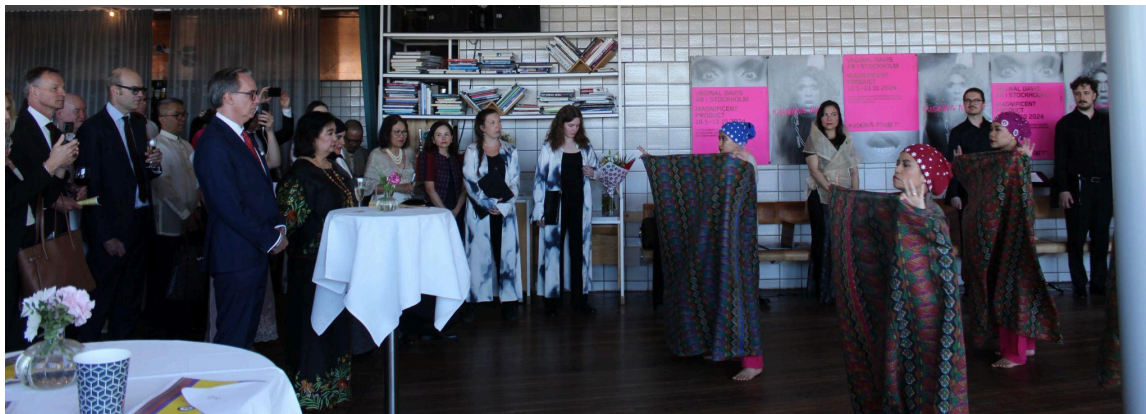
Euro Asian Dance Group performed a Malong Dance