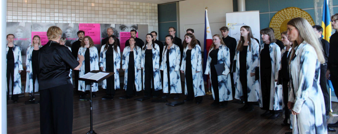
Hägersten A Cappella Choir singing the Leron-Leron Sinta