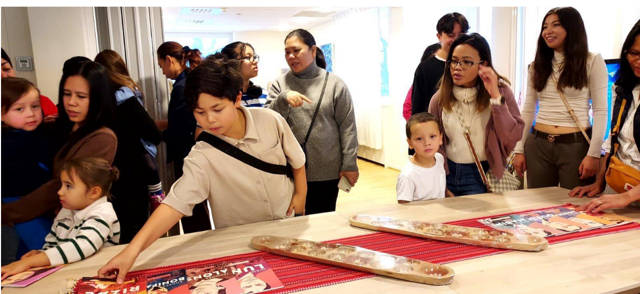
Viewing the Books of Filipiniana Library