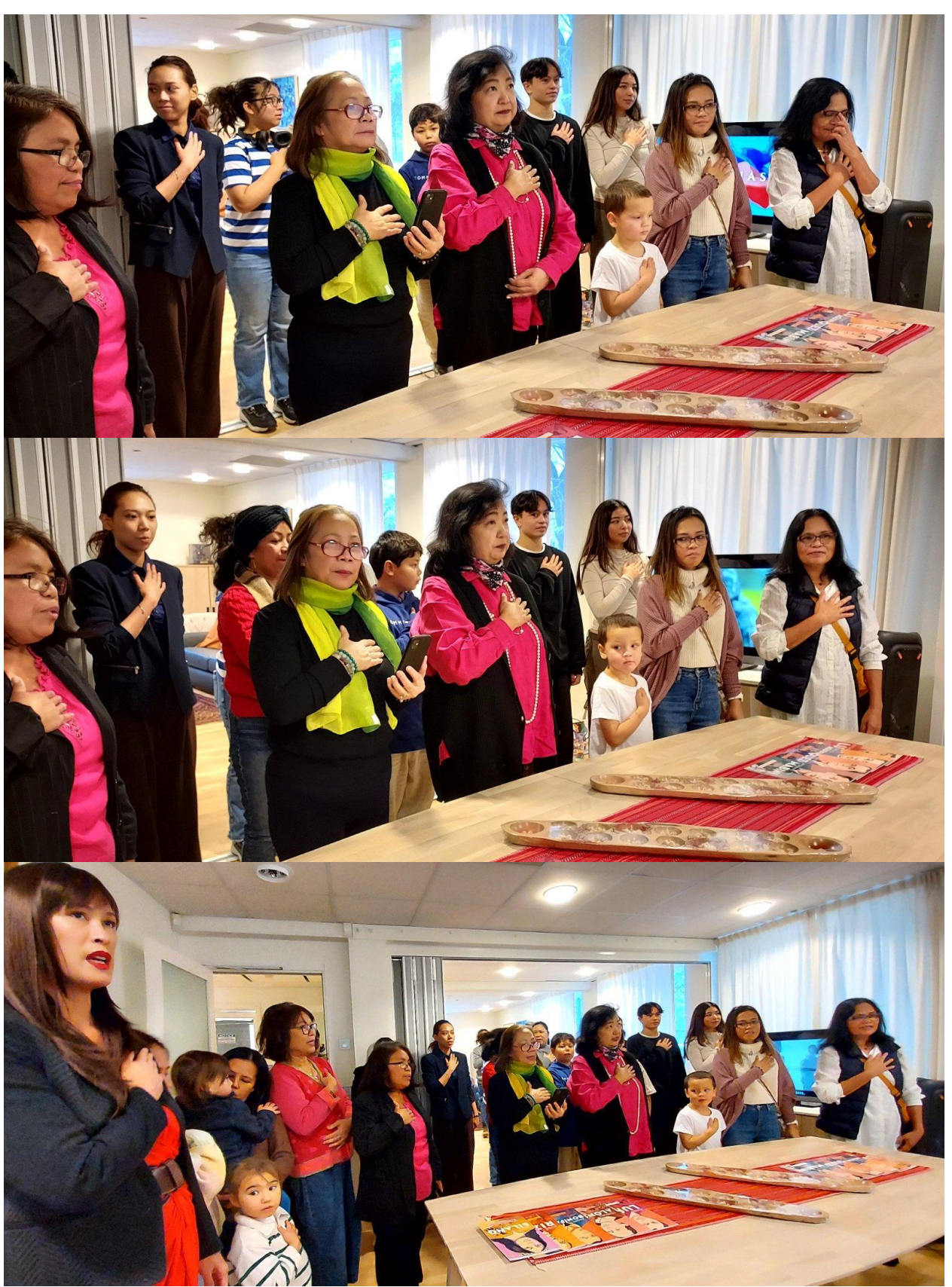
Singing the Philippine National Anthem